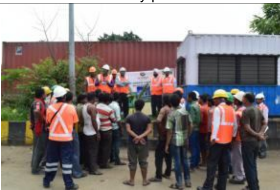
RSEA and Regional Ops Head involved in awareness campaign.