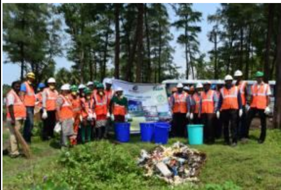
Team at beach

After initiating the Swachhata Abhiyan at terminal, the drive was extended to outside the gate and the terminal representatives visited local beach at Uran (village Nagaon) on 15 th Sept 2015 to get the area clean. The beach was cleaned and the debris was transferred to the dustbins at the beach for disposal. 32 staff from NSICT participated in the campaign. Around 30 kgs of debris was removed from the beach by the team.