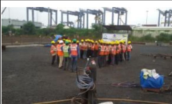
NSIGT project site

The areas covered were contractor's rest area, external truck drivers gathering, parking plaza outside the gate, NSIGT project site, survey point. These awareness campaigns are planned during the entire week.