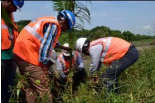
Tree plantation by staff - 2