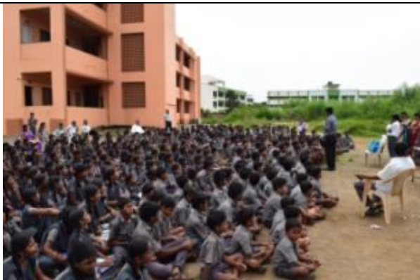
Phunde School batch 2