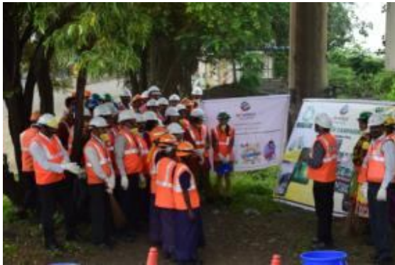
Awareness to gathering on terminal cleaning activity

Swachhata Abhiyan was arranged on 14 th Sept 2015 in the terminal with an initiative of cleaning the terminal premises along with the housekeeping staff. The opportunity was used to spread the awareness on environmental protection and importance of good housekeeping to support the environment care with the gathering.