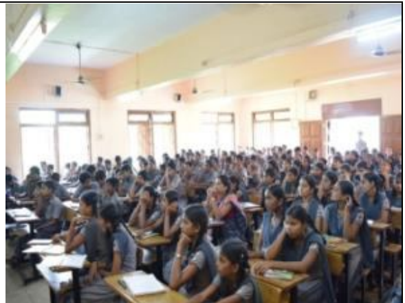
Total 370 students attended in 02 batches