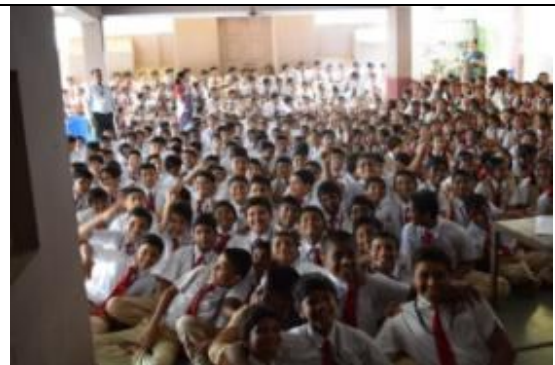
St. Mary School