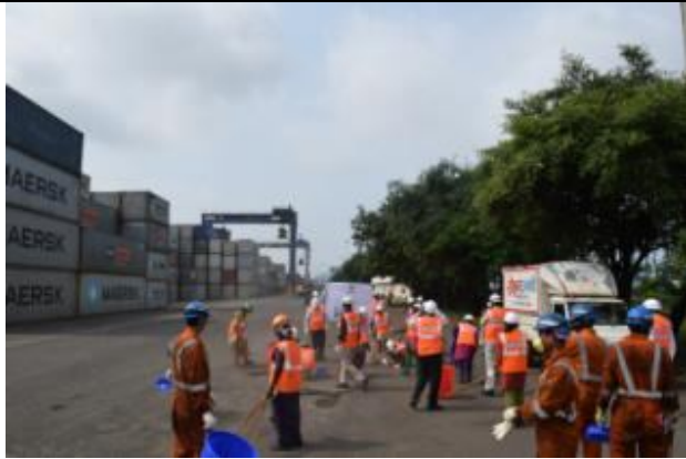
Cleaning activity at yard area.