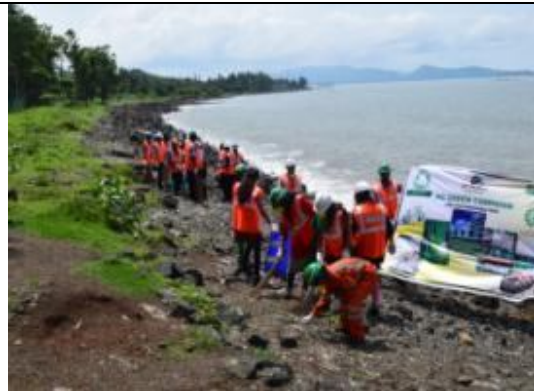
Beach cleaning activity at Nagaon beach, Uran