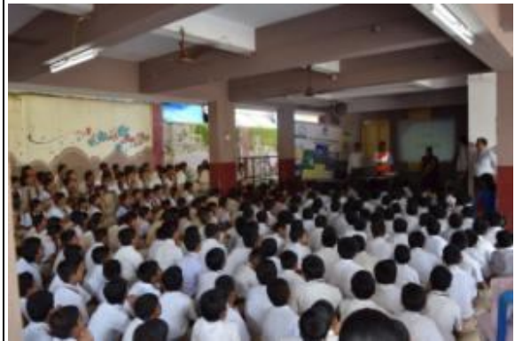
St Mary School