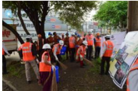
Cleaning activity at yard area