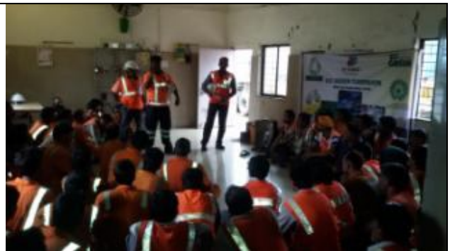
Contractor's rest area.