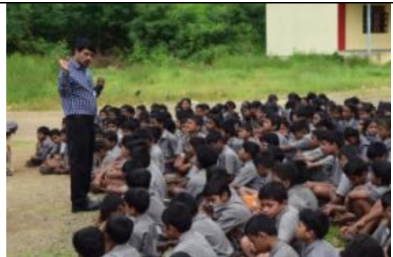
Phunde School batch 2