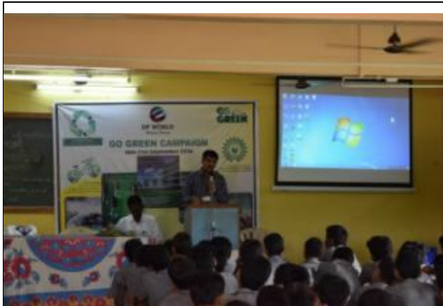
Awareness at Phunde School