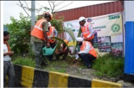
RSEA and Regional Ops Head involved in tree plantation.