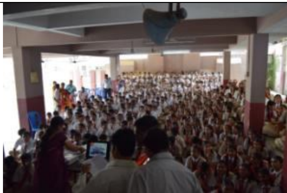
St Mary School