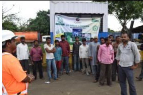
External truck drivers