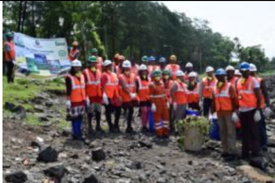
Beach cleaning activity at Nagaon beach, Uran - 2